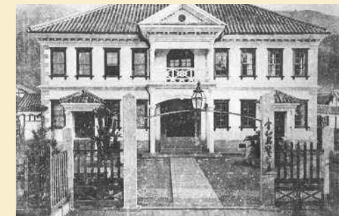
Former Uwajima Police Station